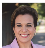
Communications minister Michelle Rowland