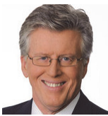
MC Broadcaster Tim Webster